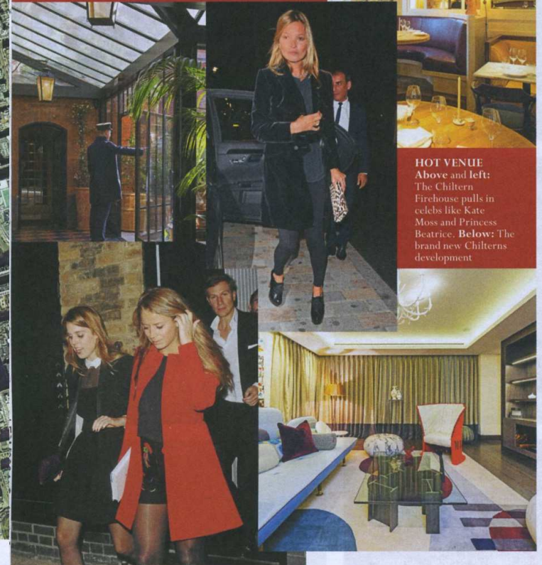
HOT VENUE Above and left: The Chilterns Firehouse pulls in celebs like Kate Moss and Princess Beatrice. Below: The brand new Chilterns development

“ MARYLEBONE HAS EMERGED AS 'THE SIXTH NEIGHBOURHOOD' ”