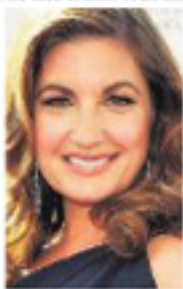
Legacy: Karren Brady